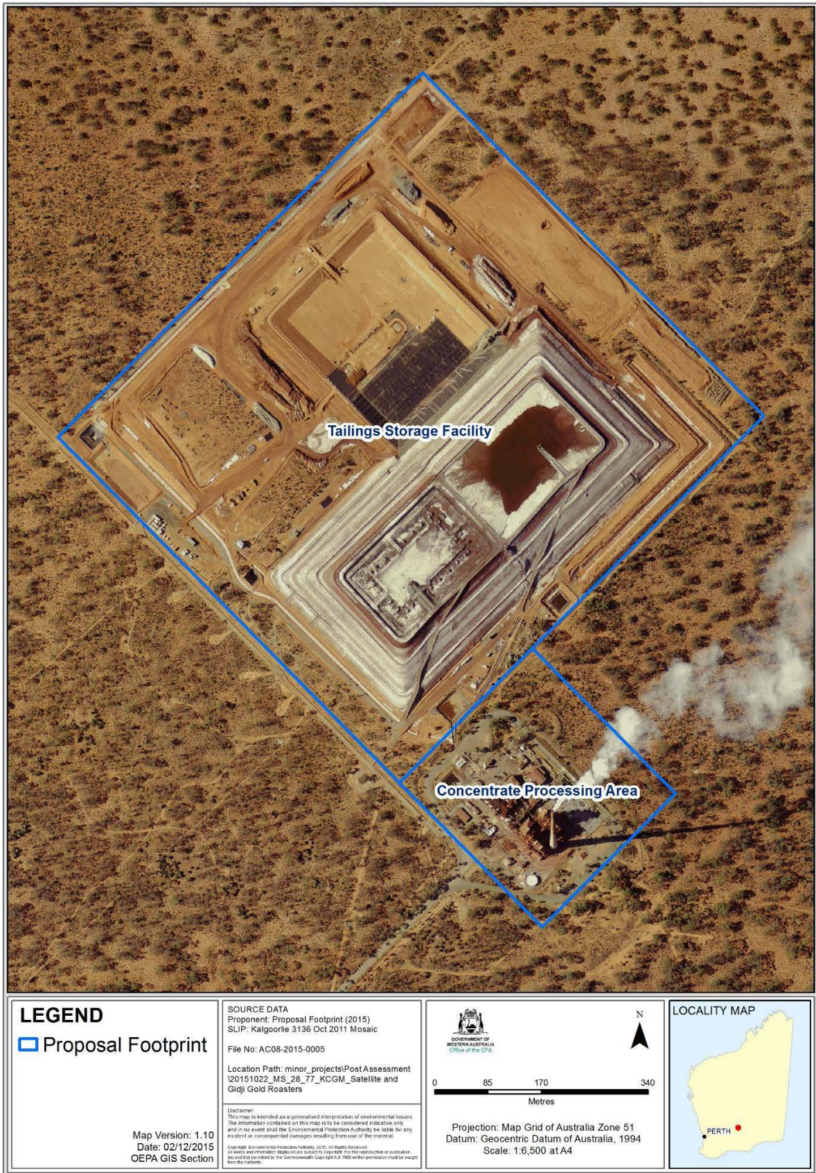
Figure 2: Disturbance Boundary