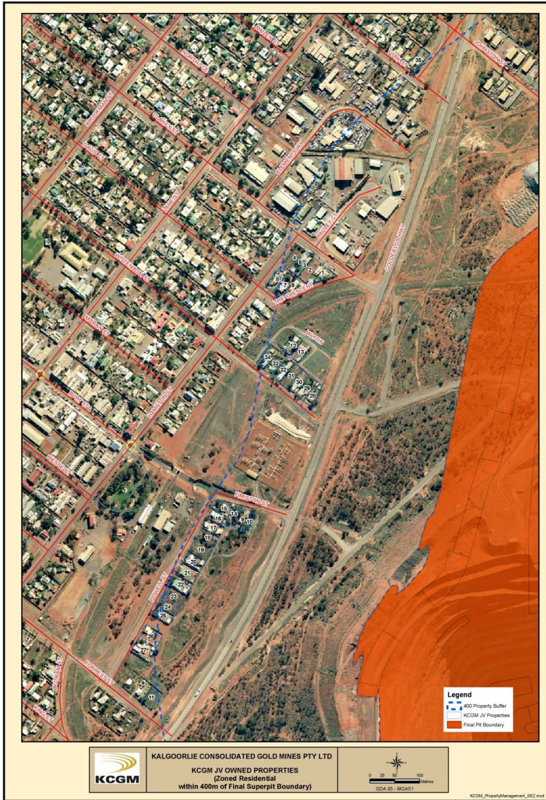
Figure 2 - Plan Showing Residential Premises Located within 400 m of the Golden Pike Mining Operation