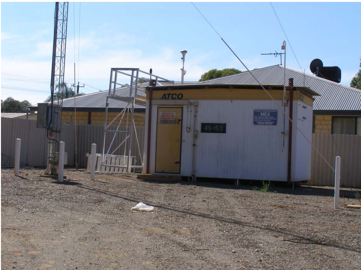
Plate 1 - MEX Monitoring Site